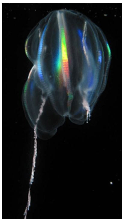
Light refracting off a ctenophore in the Arctic ocean

Strange life inhabits the peculiar environments of the ocean depths. As you descend, you'd find flattened fish with bulging eyes, luminescent lures and extensional jaws that allow some fish to swallow prey larger than themselves. Chains of pulsating, transparent colonial animals called salps float in the water column along with millions of plankton, fragile, shelled microscopic organisms called radiolaria and an abundance of varied-shaped jellyfish.